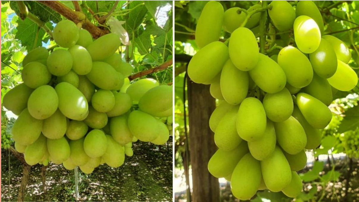
ARRA 15 on ORVI 's farm also appears to be a big success also this season.

Andre Vermaak reports: "ARRA 15 harvest at ORVI will start the 4th of December, an absolute great timing for the market demand, and so far the berries look simply amazing reaching 23 to 27 millimeters in size. The strong bunches will surely have a great shelf life post-harvest".