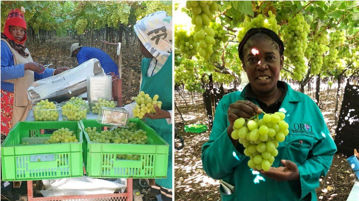
Early Sweet Field packing on ORVI farm.

The Early Sweet season at ORVI started a little later this year due to the extended cool weather during the month of September but it has now reached its full capacity. Due to the climatic condition, the berries are really heavy and strong and the bunches look beautiful.