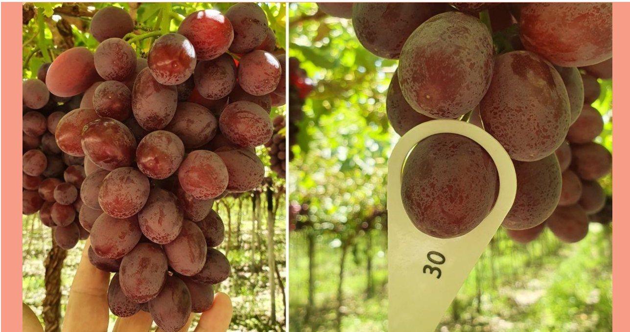
ARRA 29 harvest will begin soon in ORVI 's fields.