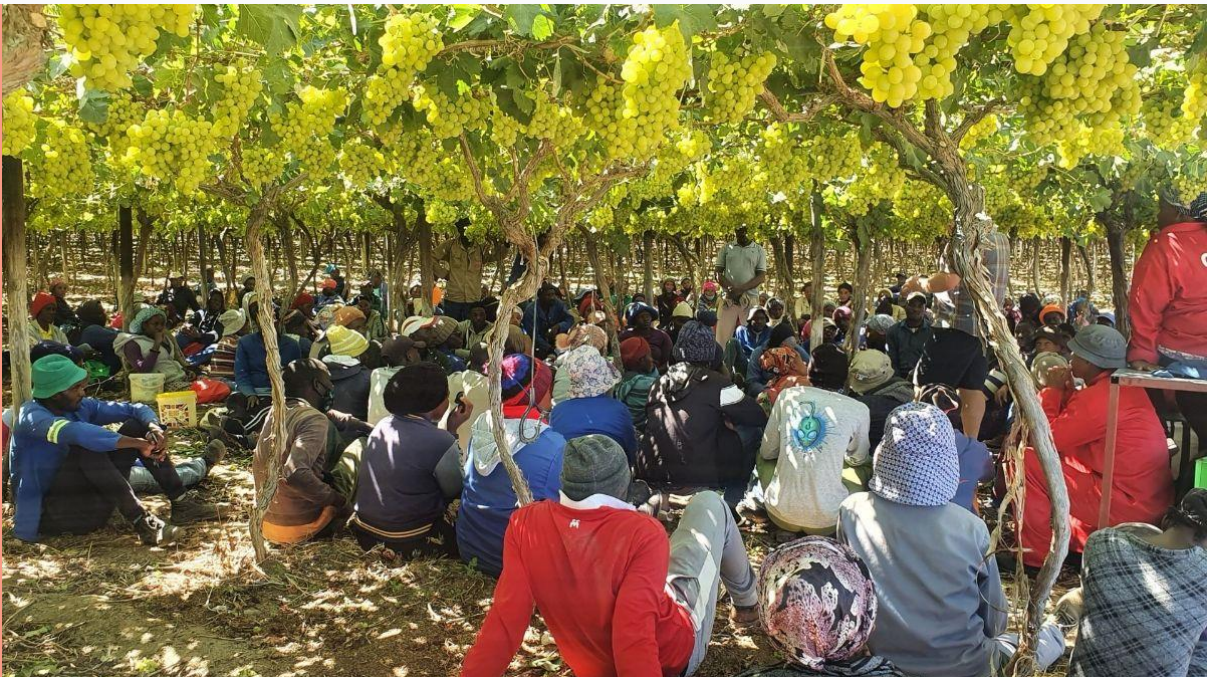
Training before harvest: a beautiful shot of the ORVI team under Early Sweet vines right before starting their day.

The Early Sweet season at ORVI started a little later this year due to the extended cool weather during the month of September but it has now reached its full capacity. Due to the climatic condition, the berries are really heavy and strong and the bunches look beautiful.