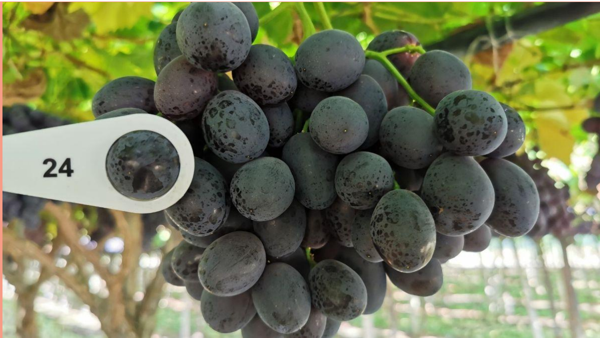
ARRA 14 (ARRA Mystic Bloom™) from Capespan .

The mid black variety ARRA 14 (ARRA Mystic Bloom™), grown mainly in Namibia and South Africa, has this season, reached very exceptional berry size, desired bunch development and has already fully developed its color. This 2020 harvest at Capespan is expected to start from week 49.