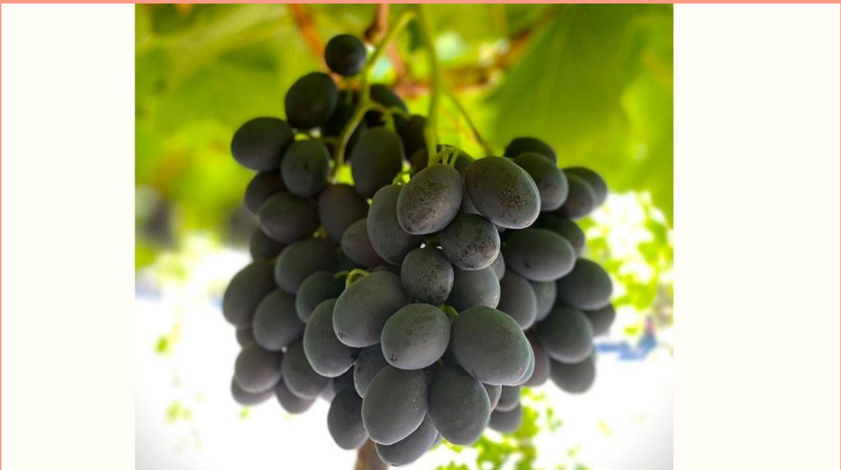
Brix is almost there and the Solar Grapes ARRA 14 harvest is just around the corner.