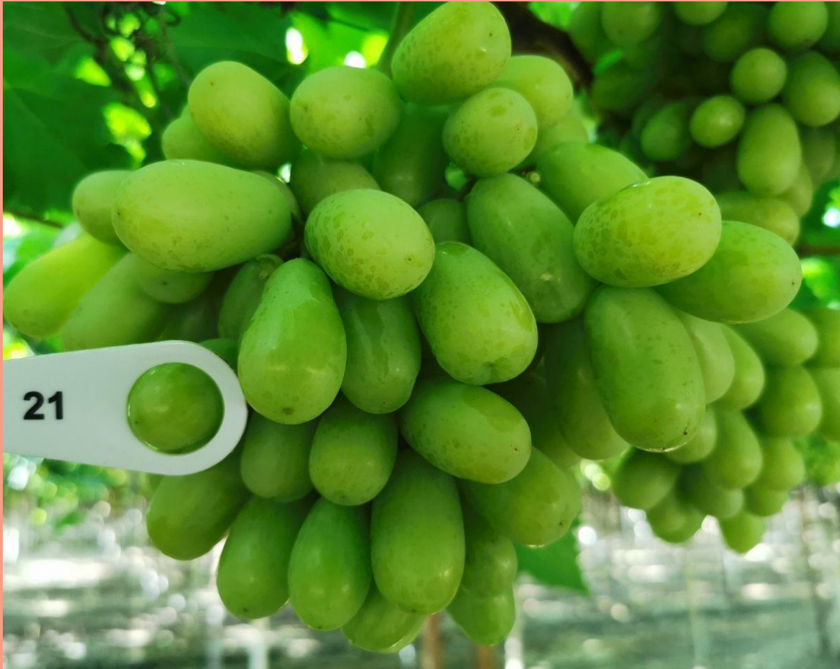
Sweetness worth sharing! ARRA 15 in Capespan's field on its way to ripening.

The Namibian packing season started 10 days later than in 2019. So far the crops look excellent reaching their optimal berry size and color development thanks to warm days and cool nights.