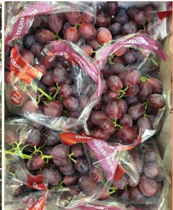
Beautiful ARR 29 (ARRA Passion Fire™) from ORVI.

A special thank you to the growers for sending us these beautiful pictures and updates directly from the farms. We are always pleased to receive news from you! A big thank you to all the entire TopFruit team for their extensive technical assistance and dedication to the Early Sweet and ARR Varieties.